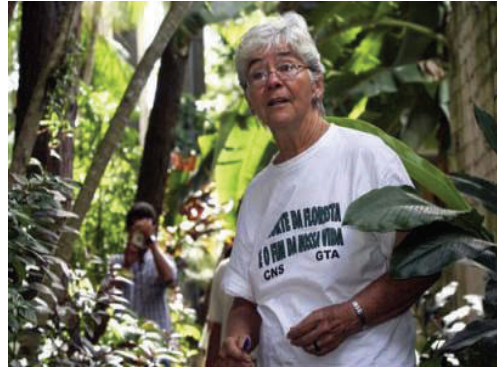
Sister Dorothy Stang, 2005